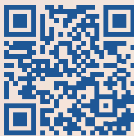
Scan code for more information