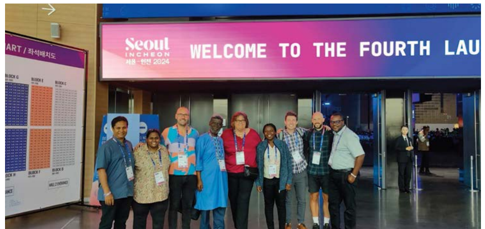
SU participants from around the world meet together in Seoul