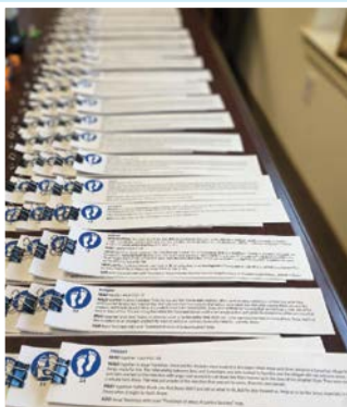
Lenten reflections cut and ready for insertion into daily packets for the family kit.

There are a gazillion ways to volunteer for Scripture Union. Some the staff can plug you right into, and some require imagination springing from your specific gifts. Either way you will be blessing others by helping SU.” —Robin