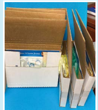
Footsteps of Jesus: A Lenten Journey boxed and ready to go!