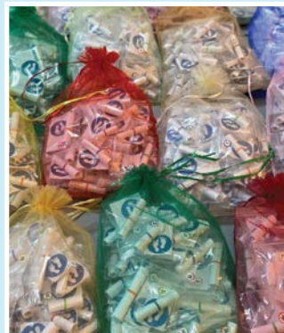
Countdown to Easter. Imagine the fun it will be to open each scroll, read together, and place the sticker on the journey map.