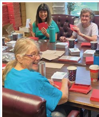
Volunteers assembling God’s Promise Kept, family Advent journey.