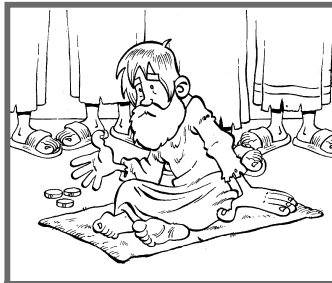
The paralyzed man couldn't get to Jesus.