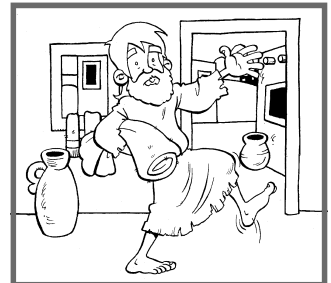
Jesus made him well!

Use these pictures to re-tell the story.