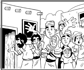
Jesus was teaching the crowds.